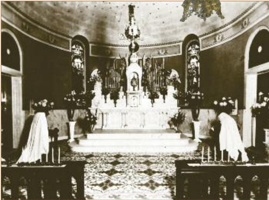
Our sisters began the practice of Perpetual Eucharistic Adoration in 1902. Today our sisters continue Daily Adoration for the needs of the people of Western New York and beyond.

In 1902, forty-one years after our coming to Buffalo, we were gifted at our Pine Street motherhouse with Perpetual Adoration of the Blessed Sacrament. We carried the gift of Eucharistic Adoration to our Mill Street motherhouse at the time of its foundation in 1928, and then to our new St. Mary of the Angels on Reist Street in 1999. We remember this great gift, we celebrate it, and we give thanks!