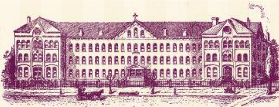
Our sisters built our first motherhouse on Pine Street near Broadway in downtown Buffalo in 1882.

In 1902, forty-one years after our coming to Buffalo, we were gifted at our Pine Street motherhouse with Perpetual Adoration of the Blessed Sacrament. We carried the gift of Eucharistic Adoration to our Mill Street motherhouse at the time of its foundation in 1928, and then to our new St. Mary of the Angels on Reist Street in 1999. We remember this great gift, we celebrate it, and we give thanks!