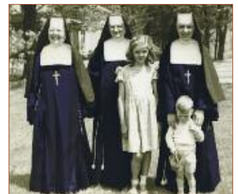
By the mid 20th century, our sisters taught in elementary and high schools in the United States and Puerto Rico. They continue this important ministry of education today in schools throughout Western New York, and as far away as Kenya, East Africa.