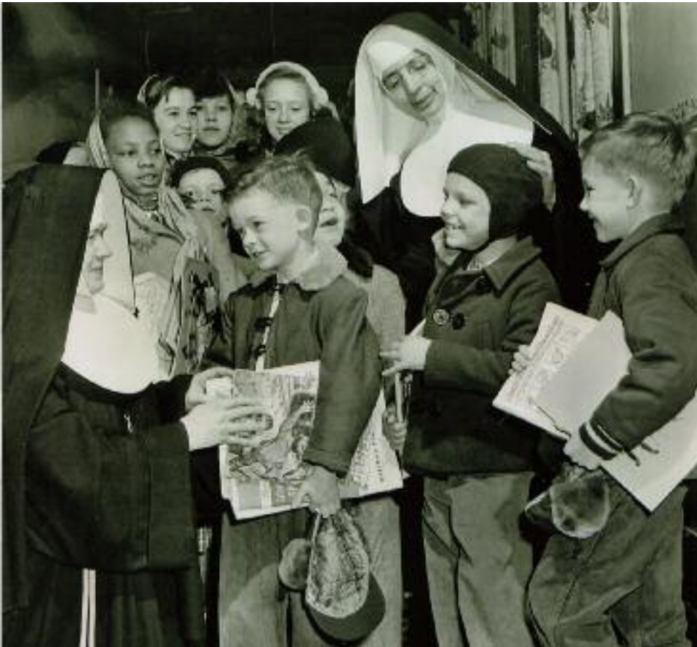
Our sisters cared and nurtured the children at the German Roman Catholic Orphanage on Dodge Street in Buffalo, dating back to 1874.

Our keen memories of the stories regarding the early history of our community recall that several sisters left the original Philadelphia congregation to begin a mission in Buffalo in December of 1861 with only seventy-five cents. When the sisters arrive at the Buffalo depot they gave fifty cents to the porter to transport their trunks to Pine Street. Thus, with twenty-five cents, and much trust in God, we began serving the needs of others through education, health care, care of the elderly and orphans, all of which led us in the course of time to parish ministries, social ministries, foreign missions, service to immigrants and refugees, retreat work and spiritual direction and whatever else might be the needs of the people of God.