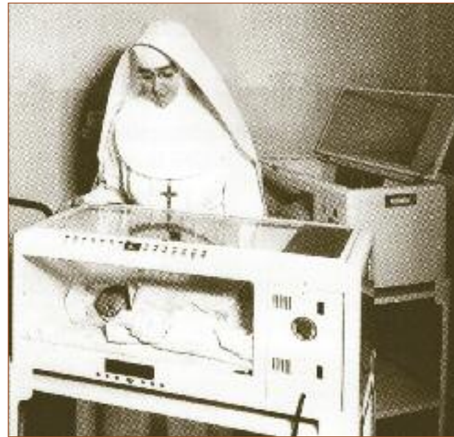
In 1907, our sisters founded St. Mary's Hospital in Lewiston, NY, and through the years several hospitals flourished under the leadership of our sisters.

In 2003, the Franciscan Missionary Sisters of the Divine Child merged with the Buffalo group. In 2007, sisters who had left Buffalo early in our history to found a mission in Pittsburgh, and eventually became an autonomous group, merged with us, bringing one more congregation