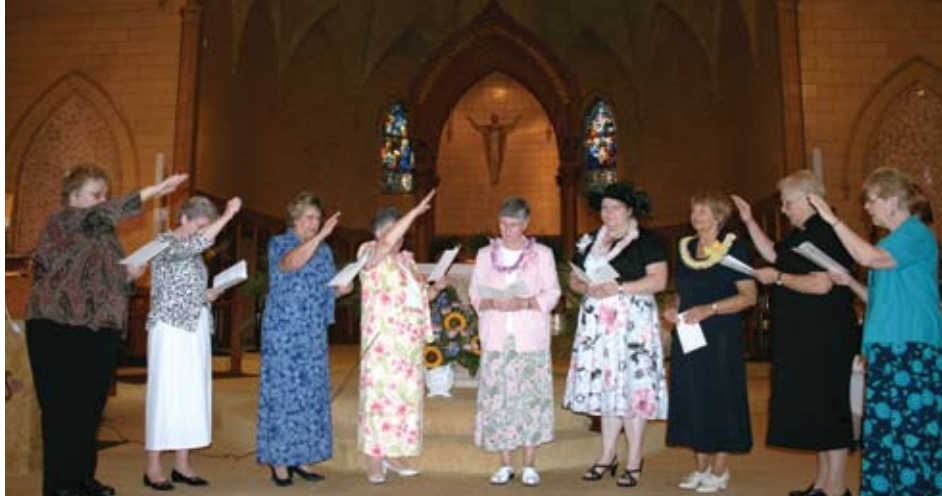
Leadership with newly professed